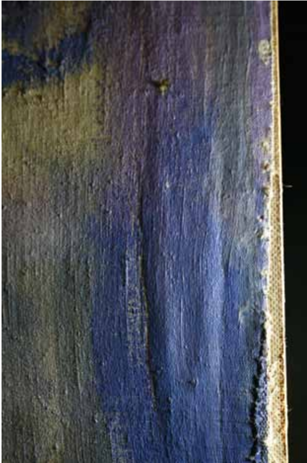
12 Detail in raking light of de-lamination between canvas and masonite. Photographer: Mirjam Liu, October 2010.

Possible interventions can be minimal invasive as local regeneration or re-consolidation of the adhesion or maximal as removal of the materials in the two ma-rouflages. Local re-attachment between the canvas and the masonite will be a challenge because of the sensitive and absorbing ground which is easily stained by water and most organic solvents. This approach will demand tests on how to apply suitable and adequate portions of non-staining glue into the de-laminations and from the front of the paintings. Fast evaporating organic solvents might not stain the original materials, but this also requires tests. The adhesive has to be low-viscous to be inserted locally to the voids through the paint layers and canvas threads and with a thin syringe (which inevitably will leave small holes, although invisible for the Aula audience c. 7-3 m below), but its viscosity will also be crucial due to the strong capillary forces in the absorbing ground and canvas.