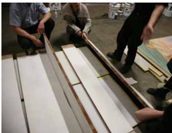
3 Visual examination of the test panel with a double marouflage after being cut. Photographer: Karen Mengshoel, April 2010.

The paper and insulation to the reverse sides were detached right after the paintings were transported to the temporary studio as these materials could emit dust and hazardous glass fibers into the working areas. The paintings were then surface cleaned with latex free polyurethane 33 sponges. During cleaning, isolated ar-