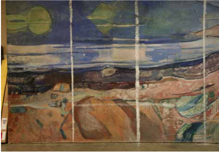
4 Detail of Alma Mater showing stripes of local facing with cyclododecane in areas that correspond with masonite joins. Photographer: Karen Mengshoel, September 2010.