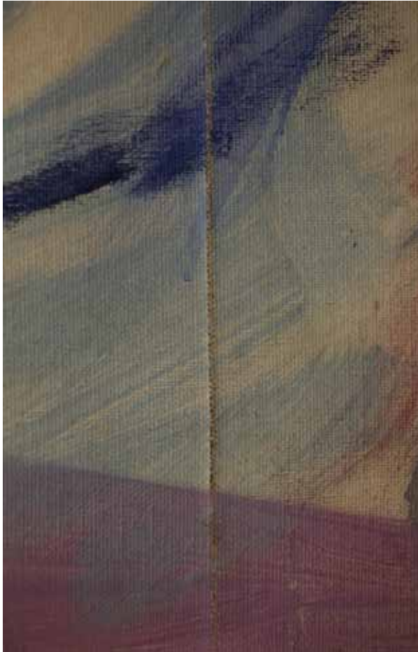
1 Detail of Men Reaching towards the Light showing a typical tear and bulk in the canvas, flaking paint and a number of paint losses. These were caused by movements in the wooden framework behind the masonite from 1946. Photographer: Mirjam Liu, January 2011.

the main painting entitled, The Sun (figure 2). 12 The eleven paintings were then surface cleaned, parallel to the continued in-depth investigations concerning the condition of the paint surfaces and Munch's techniques. The structural conservation treatment was carried out in 2010 and all the eleven paintings were returned to the Aula during the beginning of 2011.