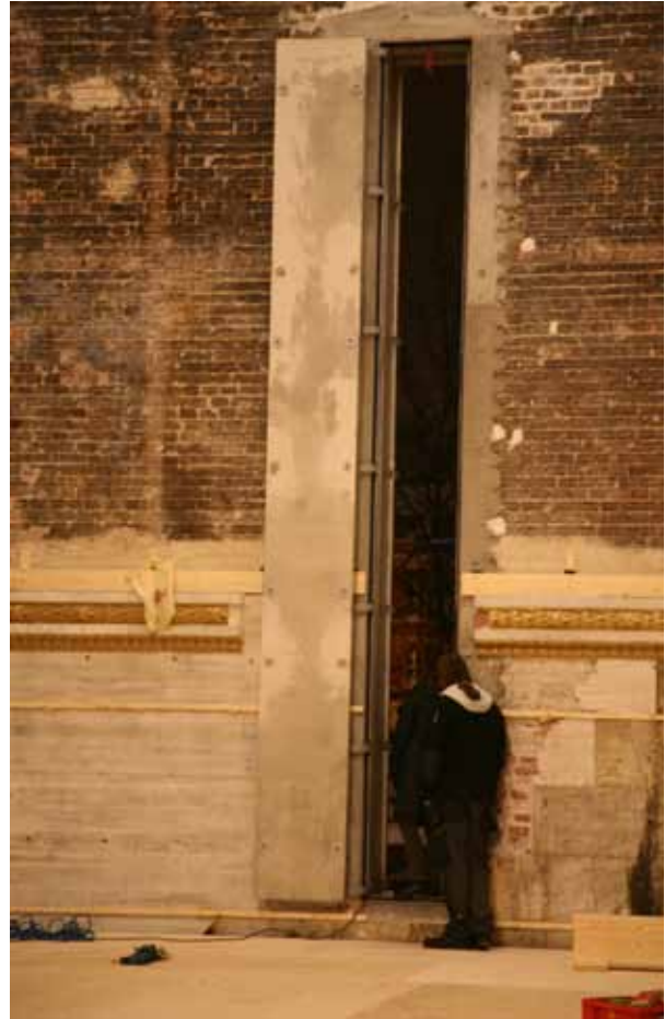
2 The new door (5,6 x 0,55 m) during opening at night. Photographer: Karen Mengshoel, March 2011.

A pilot-project carried out during 2006-2008 revealed a wide variety of limitations and options relevant to proposed conservation treatments. The condition of the paintings appeared to be similar across the eleven works and the artist seems to have also used the