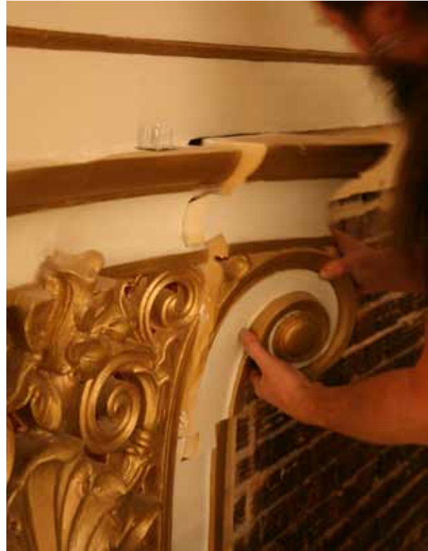
10 Detail of a volute wall capital made detachable to simplify new and future detachment and re-attachment of the paintings. Photographer: Mirjam Liu, February 2011.

mensions of the niches prior to the final installation. A protective U-shaped aluminium profile frame 46 was glued on to the exposed honeycomb edges with a two-component epoxy resin. 47 This framing system was chosen to provide solid support for the final fixing screws, 48 to increase the rigidity of the marouflaged paintings, to improve their handling properties and to seal the open edges of the honeycomb. In some areas, where the fit might be tight, 49 an aluminium tape was used instead of the aluminium frames. 50 Since the marble shelves, along the lower edges of the niches were uneven, the paintings were leveled out by using several wooden and plastic wedges.