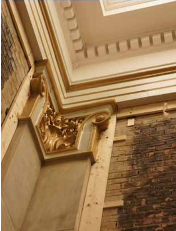
9 Detail of the new wooden frames along the edges of the picture niches for the attachment of the paintings. Photographer: Mirjam Liu, December 2010.