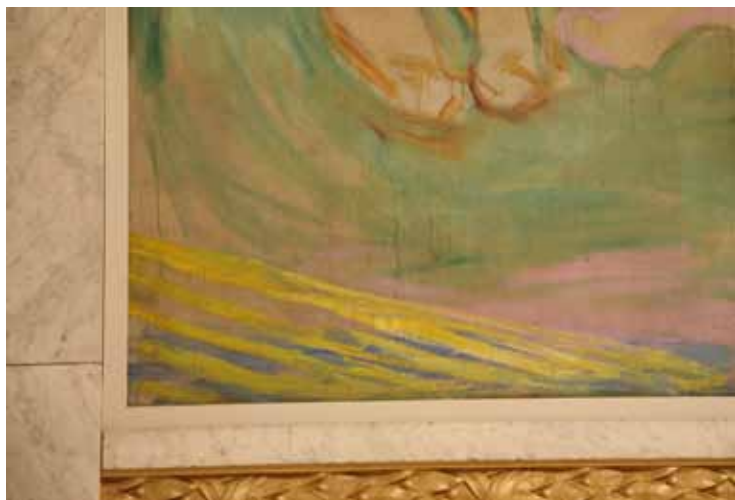
11 Detail of the new picture frame. Photographer: Karen Mengshoel, April 2011.