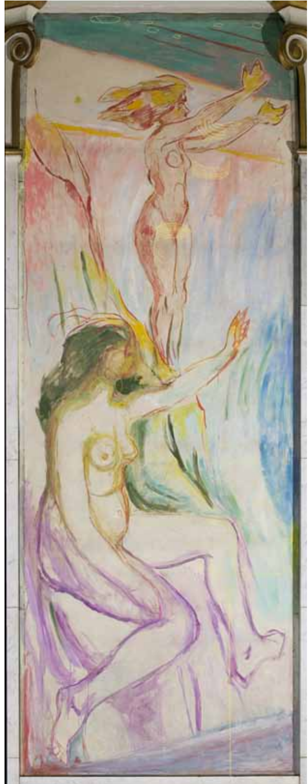
13 Metigo Map of Women Reaching towards the Light showing the areas of de-laminations (yellow) between canvas and masonite. Illustration by Mirjam Liu, October 2010.

Possible interventions can be minimal invasive as local regeneration or re-consolidation of the adhesion or maximal as removal of the materials in the two ma-rouflages. Local re-attachment between the canvas and the masonite will be a challenge because of the sensitive and absorbing ground which is easily stained by water and most organic solvents. This approach will demand tests on how to apply suitable and adequate portions of non-staining glue into the de-laminations and from the front of the paintings. Fast evaporating organic solvents might not stain the original materials, but this also requires tests. The adhesive has to be low-viscous to be inserted locally to the voids through the paint layers and canvas threads and with a thin syringe (which inevitably will leave small holes, although invisible for the Aula audience c. 7-3 m below), but its viscosity will also be crucial due to the strong capillary forces in the absorbing ground and canvas.