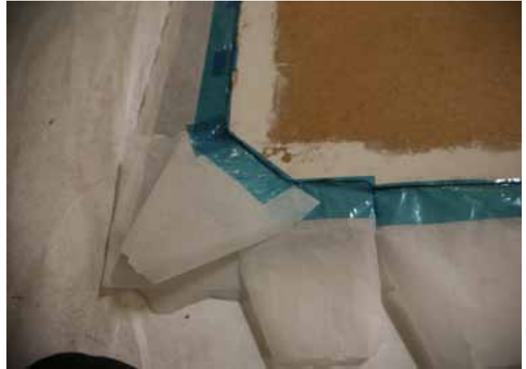
6 Detail of the reverse side of Alma Mater showing the masking with a silicone release tape and paper to avoid spillage of the marouflage adhesive on to the surface of the painting. Photographer: Karen Mengshoel, September 2010.

The edges of the painting had to be prepared so as to safeguard that no adhesive would spill over the edge and adhere to the canvas (which in some areas was larger than the masonite) and the painted surface itself. A silicone adhesive release tape 37 was used to mask off the edges, approximately 5 mm in over the masonite, with the rest of the tape adhered to the silicone release paper (figure 6). Any spillage would then run down the silicone paper and not onto the foam which could risk it coming into contact with the paintings surfaces.