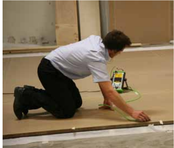
8 The non-destructive testing with Bondascope 3100 on the reverse side of the honeycomb to test for dis-bond between the first and the second marouflage panel. Photographer: Karen Mengshoel, September 2010.

After gluing and positioning all of the honeycomb panels the structure was weighted down with cobblestones 41 (see figure 7) and left to dry overnight. The stones were removed and the surplus of adhesive on reverse of the honeycomb panels removed with chisels. Non-destructive testing with Bondascope 3100 (an ultrasonic [pitch catch] bond tester from NDT Systems) 42 was performed by AIM in order to check the bonding between the honeycomb panels and the masonite (figure 8). Areas with dis-bond were then filled with a low viscosity two-component epoxy 43 using a syringe through the holes in the honeycomb panels. After a couple of hours the panels were again checked with the Bondascope 3100 to establish reduction of dis-bond between the honeycomb and the masonite. The new marouflage was then left to cure for about one week before the painting could be moved away for storage.