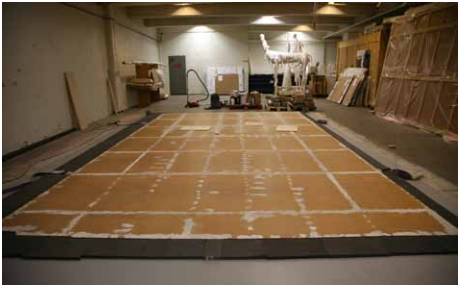
5 Reverse side of the masonite attached to The Sun with holes and gaps leveled with commercial fillers. Photographer: Karen Mengshoel, June 2010.

areas of flaking paint was consolidated with 3% sturgeon glue solution in distilled water. Consolidation was performed during cleaning and not prior since this was the most effective due to space and time constraint. The characteristics and condition of the original painting techniques led to the decision to choose cyclododecane as the non-aqueous material for the temporary facing. Two different solutions of cyclododecane was used as a protective facing to sensitive areas on the paintings such as, high impasto, areas with cracked paint and areas above the masonite joins (figure 4)